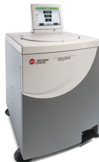
Avanti JXN 26